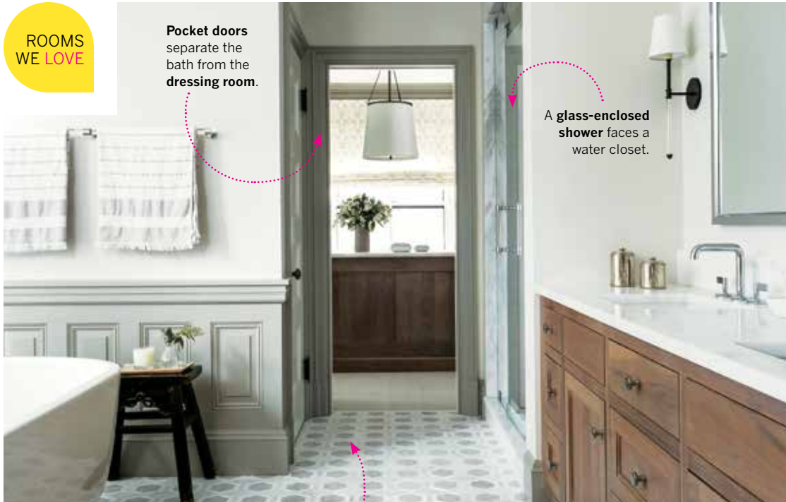
A glass-enclosed shower faces a water closet.

“The couple had zero closet space before, so adding a dressing room was an important piece of the renovation,” explains Giese.