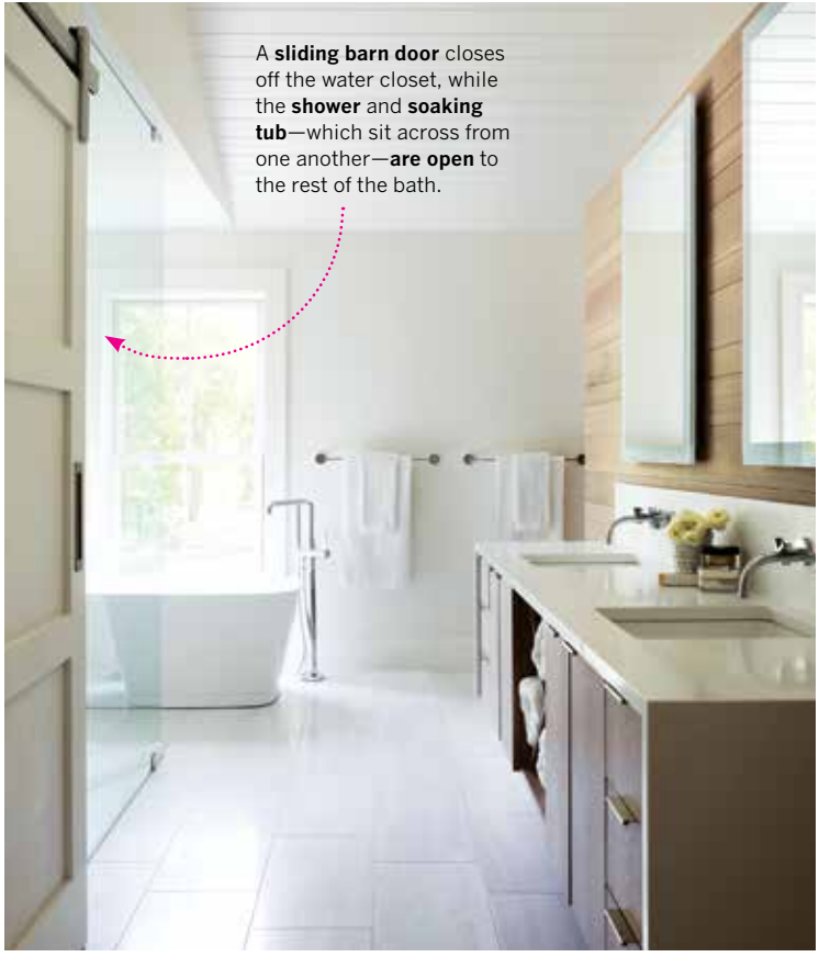
A sliding barn door closes off the water closet, while the shower and soaking tub —which sit across from one another—are open to the rest of the bath.

feeling of the high ceiling, the architects designed a floating cube to accommodate the closet while cleverly dividing the bedroom and bath. “The white-oak nickel gap on the cube features varying widths, which softens the modernism and makes it feel less perfect,” notes architect and project manager Tristan deBarros. “Plus, the wood has a weathered look that lends itself to a coastal environment.”