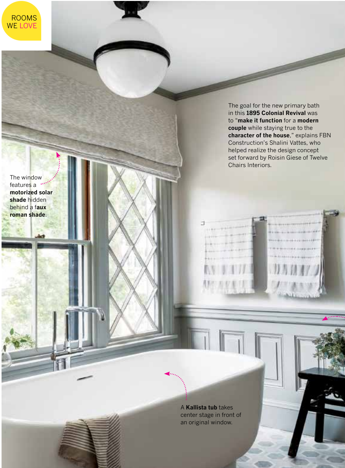
The window features a motorized solar shade hidden behind a faux roman shade .

The goal for the new primary bath in this 1895 Colonial Revival was to "make it function for a modern couple while staying true to the character of the house," explains FBN Construction's Shalini Vattes, who helped realize the design concept set forward by Roisin Giese of Twelve Chairs Interiors.