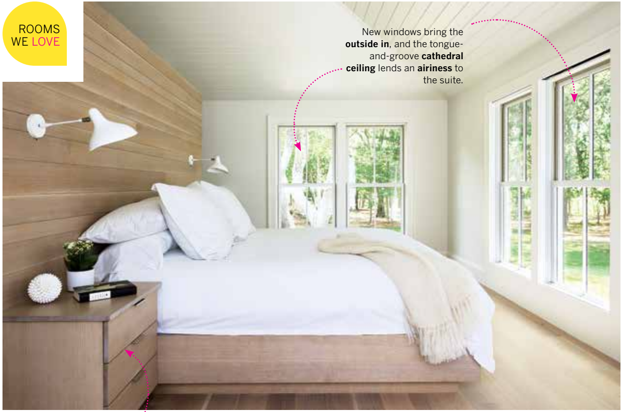
New windows bring the outside in , and the tongue-and-groove cathedral ceiling lends an airiness to the suite.